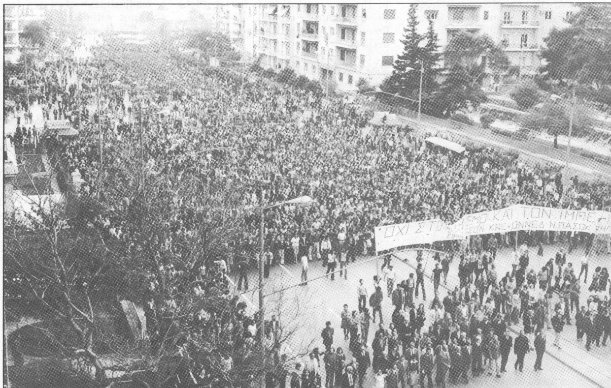
The January general strike was the biggest movement so far against Papandreou's austerity

ciple are aimed at developing the critical thinking and culture of the students, and to the benefit of computer and economic subjects that are defined in a narrowly technocratic way.